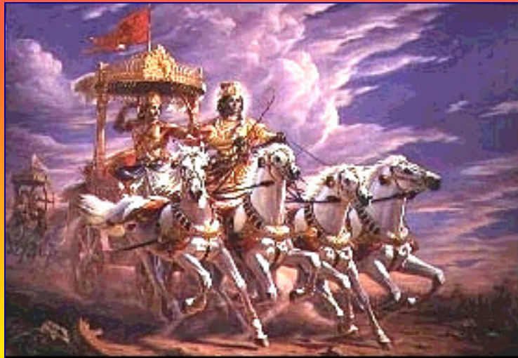
Lord Krishna as Arjuna's Charioteer and Guide

In this edition of Sai Link, we will cover 2 easy-to-understand stories which can best summarize Chapters 1 and 2 of the Bhagavad-Gita. Write to us and tell us if you are keen to include one story covering 1 chapter of the Bhagavad-Gita in the coming editions of Sai Link. We want to hear from you!